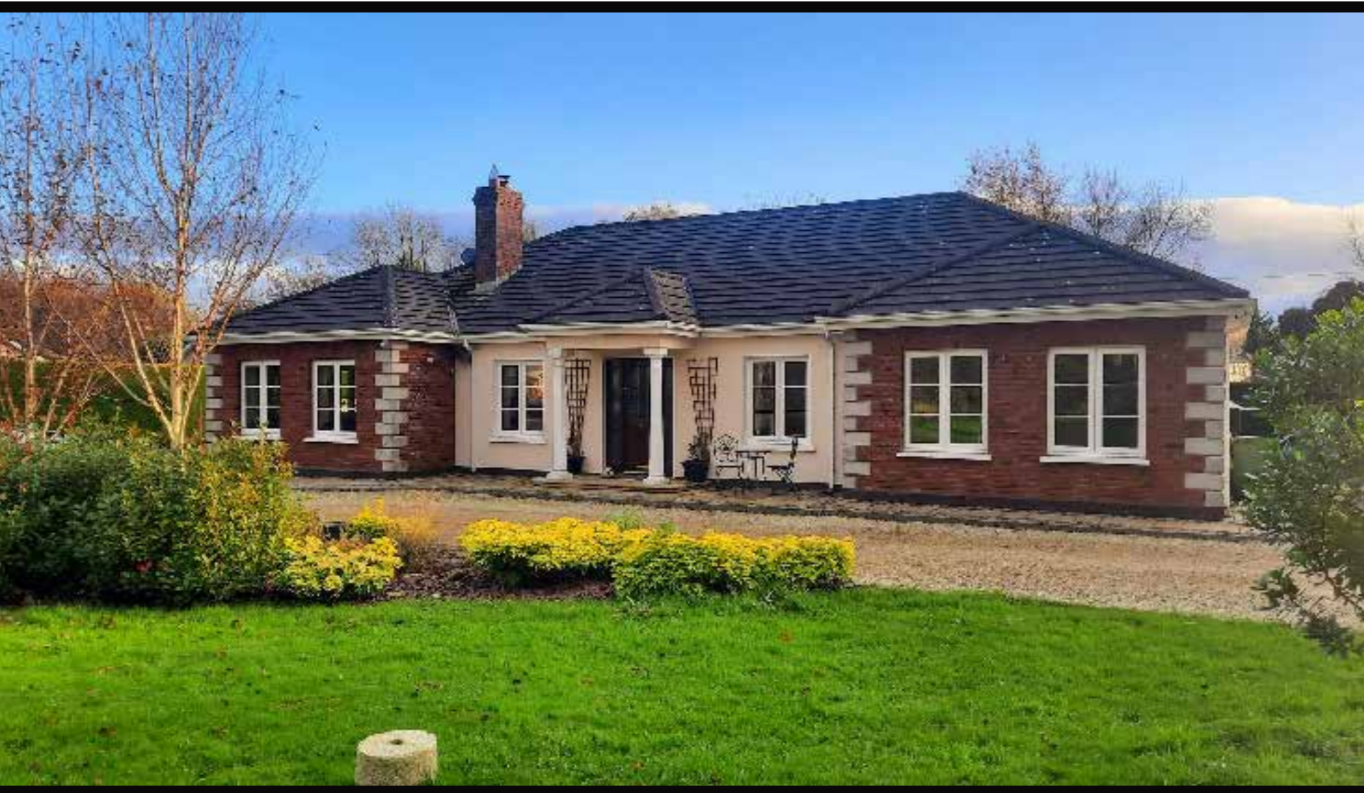
Colour: White Foil