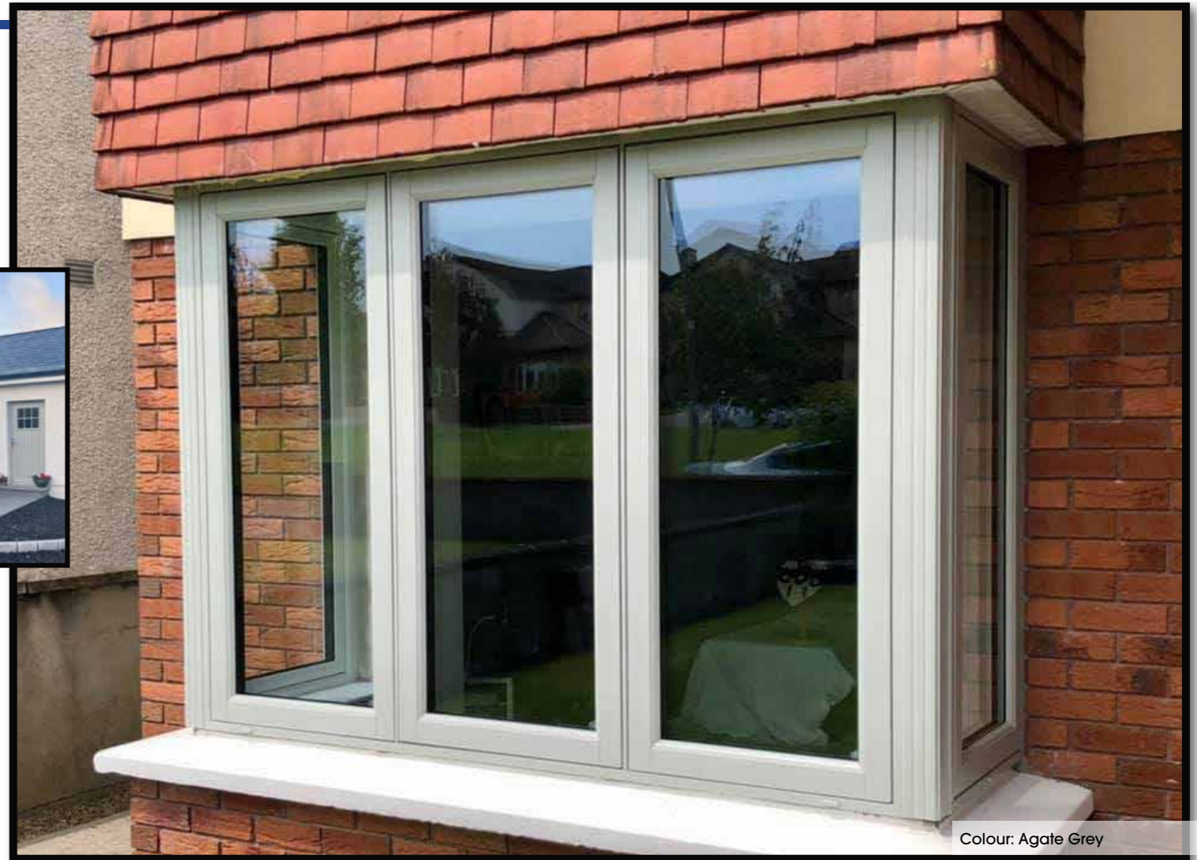
Colour: Agate Grey

For truly authentic sash windows, timberweld joints are the best option.