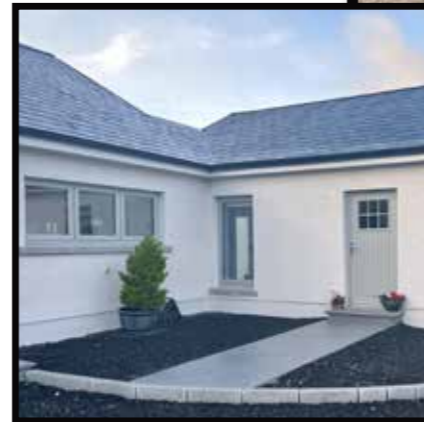
Colour: Agate Grey

If you live in a listed property or conservation area, always check with your local council and obtain the necessary Planning Permission from the Local Planning Authority before beginning any work on your property.